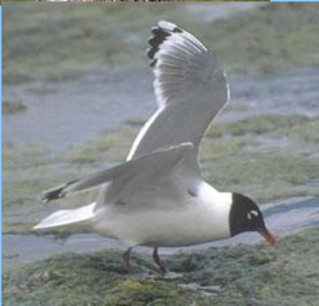
Franklin's Gull Leucophaeus pipixcan