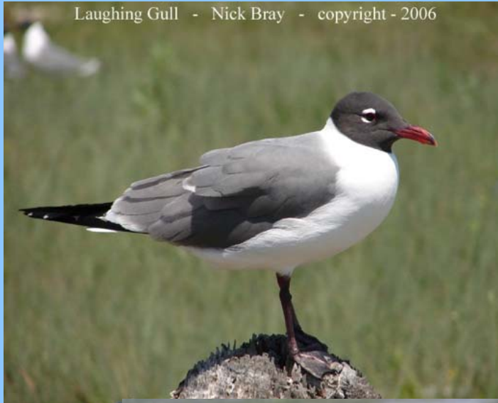
Laughing Gull Leucophaeus atricilla