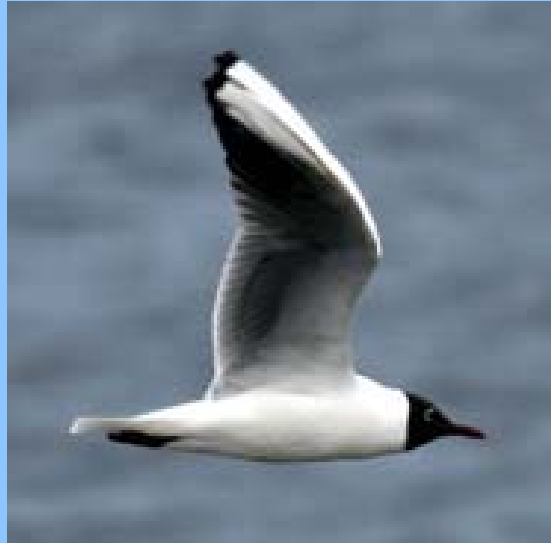
Black-headed Gull Chroicocephalus ridibundus