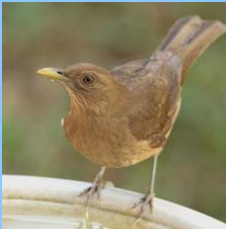
Rufous- backed Robin