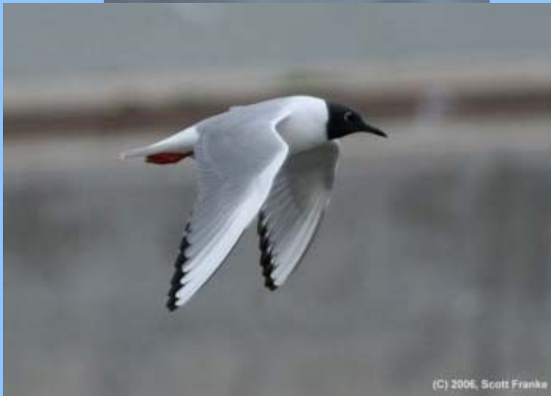
Bonaparte's Gull Chroicocephalus philadelphia