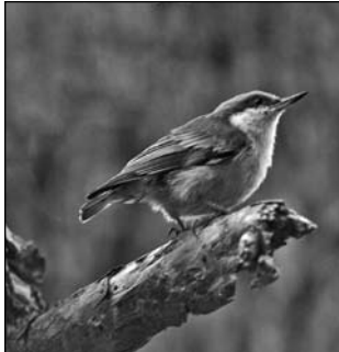
Left: Brown-headed Nuthatch, Cape Henlopen State Park, Lewes, DE, 2012