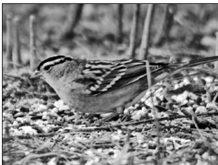
Gambel's White-crowned Sparrow, Peace Valley Park, Doylestown, PA, 2012