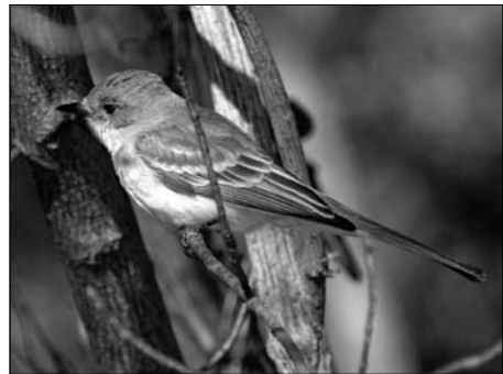
Above: Ash-throated Flycatcher, Stockton, NJ 2010