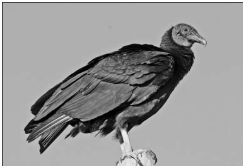
Black Vulture, Harleysville, PA, 2013