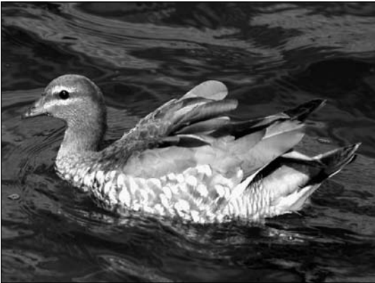
Australian Maned Duck, Peace Valley Park, Doylestown, PA, 2012