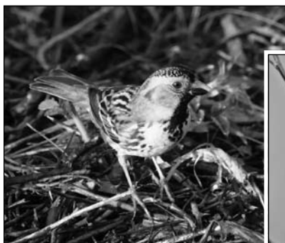
Harris's Sparrow, Brandywine, DE, 2009