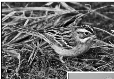
Above: Clay-colored Sparrow, Doylestown, PA, 2011