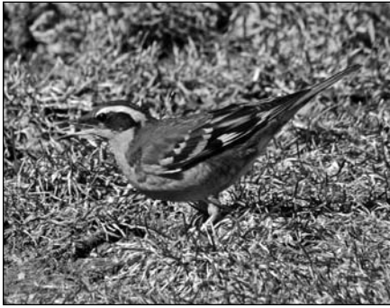
Varied Thrush, Allentown, PA, 2011

In any event, even if we don't know exactly why some of these birds that really belong elsewhere still manage to show up in our area, most of us are very, very grateful for the opportunity to get to see them.