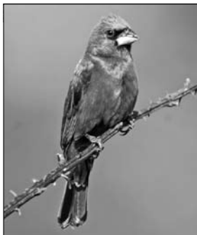
Blue Grosbeak, Bombay Hook NWR, 2013