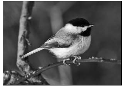
Above: Carolina Chickadee, Peace Valley Park, Doylestown, PA, 2012