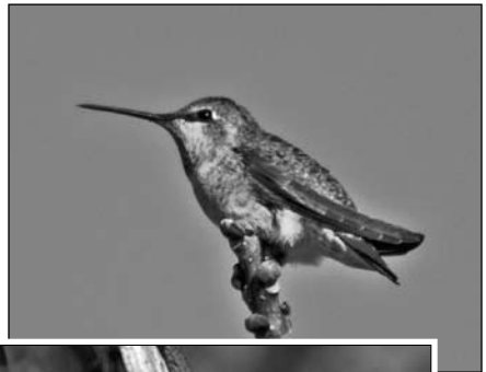
Below: Anna's Hummingbird, Shartlesville, PA, 2011