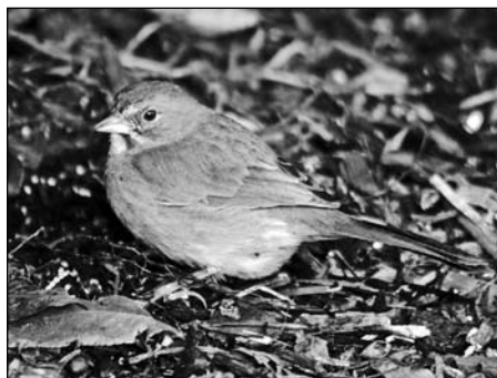
Green-tailed Towhee, Collingswood, NJ 2009