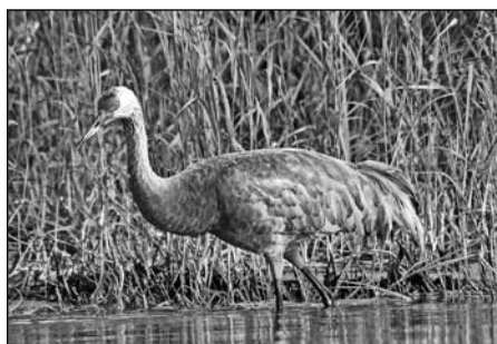
Sandhill Crane, Middle Creek Wildlife Management Area, Kleinfeltersville, PA, 2012

Finally, some birds that are common in Pennsylvania, New Jersey and Delaware could actually become extralimitals when they show up in other parts of the country at the wrong time of year. I was in San Antonio, Texas in January, 2007 for a meet-