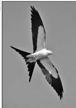
Swallow-tailed Kite, Fort Washington, PA, 2011