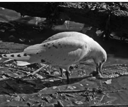
Above: Ivory Gull, Cape May, NJ 2009