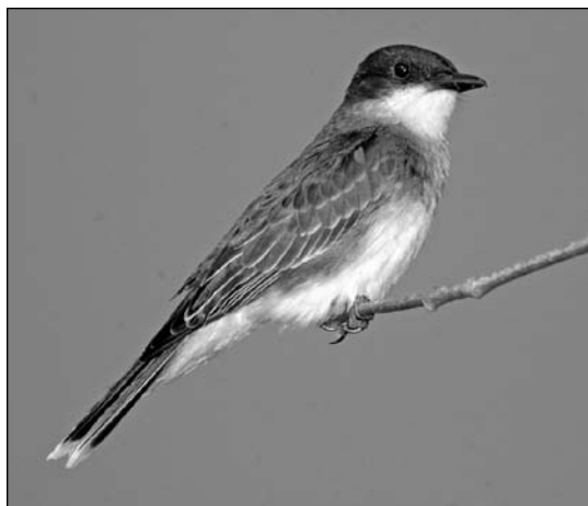
Eastern Kingbird, Mitchell Lake Audubon Center, San Antonio, Texas, 2007

ing. I had one day off and, under duress, was forced to spend it at Mitchell Lake Audubon Center. While there, I saw and photographed an Eastern Kingbird ( Tyrannus tyrannus ).