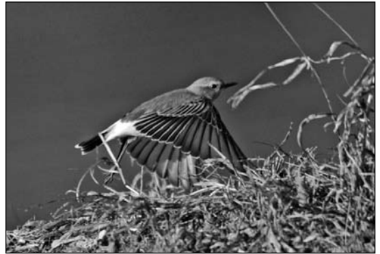
Northern Wheatear, Fox Point State Park, Wilmington, DE, 2010