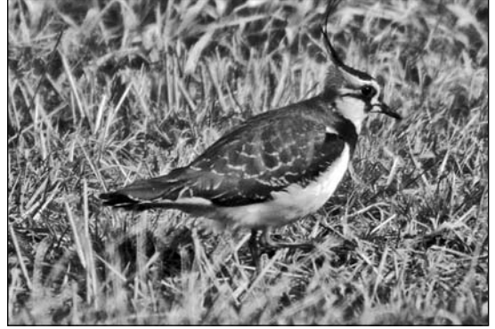
Northern Lapwing, New Egypt, NJ, 2013