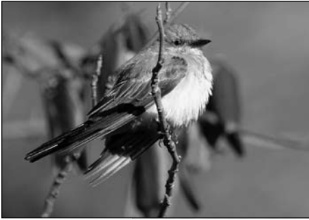
Above: Western Kingbird, Berks County, PA, 2011

Further, in addition to some of the rarer vagrants like the ones above, we also see birds in our area today, either breeding or on migration, that would have been considered extralimital fifty to sixty years ago. Some of these are Carolina Chickadee, Brown-headed Nuthatch, Black Vulture, Clay-colored Sparrow, Sandhill Crane and Blue Grosbeak. All six of these species have recently increased their range.