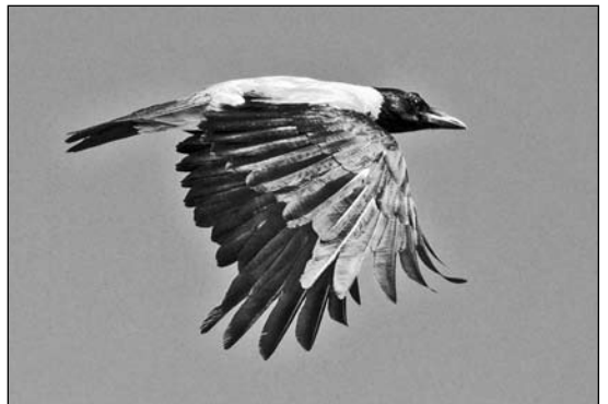
Hooded Crow, Long Beach Island, NJ, 2011