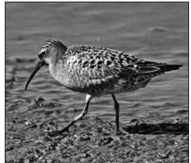
Curlew Sandpiper, Heislerville, NJ 2008

I don't mean to imply that birds are capable of making a rational decision or a conscious choice because of any of the factors above. I do think, however, a certain