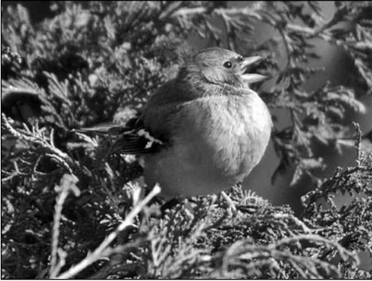
Common Chaffinch, Hunterdon County, NJ, 2012