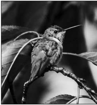
Allen's Hummingbird, Lititz, PA, 2011