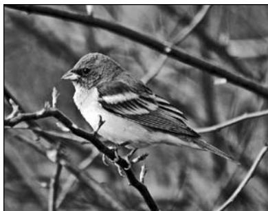
Lazuli Bunting, Red Hill, PA 2007