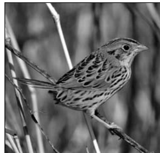
Above, right: Henslow's Sparrow, Chester, PA, 2011