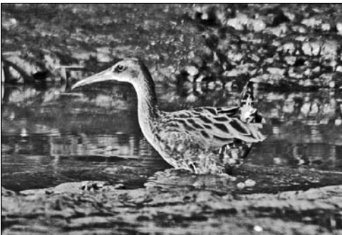
King Rail, E.B. Forsythe NWR, Absecon, NJ, 2012