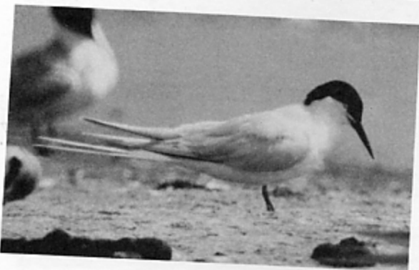
ROSEATE TERN ( Sterna dougallii )—Cape May, NJ, July 12, 1986