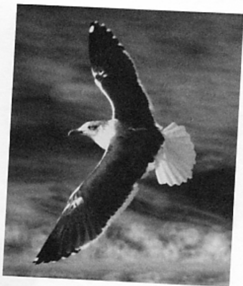
LESSER BLACK-BACKED GULL ( Larus fuscus )—Cape May, NJ, February 1, 1987