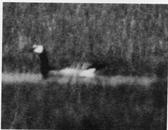
BARNACLE GOOSE ( Branta leucopsis )—Brigantine NWR, NJ, October 5, 1986