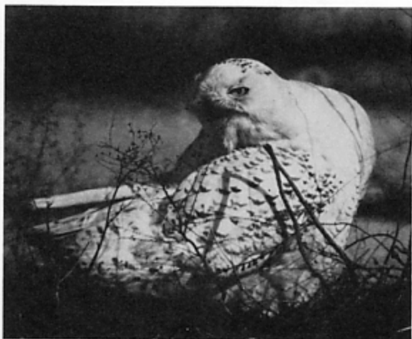
SNOWY OWL ( Nyctea scandiaca )— Caven Cove, NJ, February 2, 1987