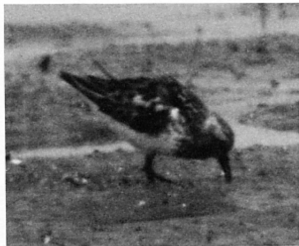
RUFIOUS-NECKED STINT ( Calidris ruficollis )—Bombay Hook, DE, July 18, 1987