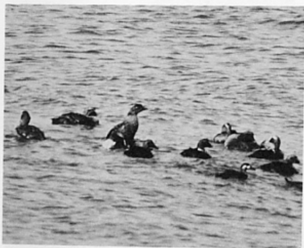
COMMON EIDER ( Somateria mollissima ) with two SURF SCOTERS ( Melanitta perspicillata )—Cape May, NJ, October 17, 1987