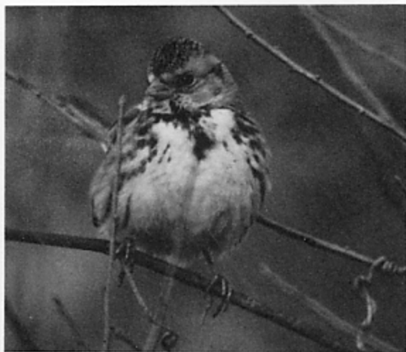
HARRIS' SPARROW ( Zonotrichia querula )—Flanders, NJ, February 2, 1986