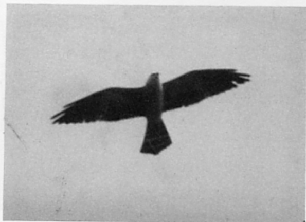
MISSISSIPPI KITE ( Ictinia mississippiensis )—Cape May, NJ, June 1, 1986