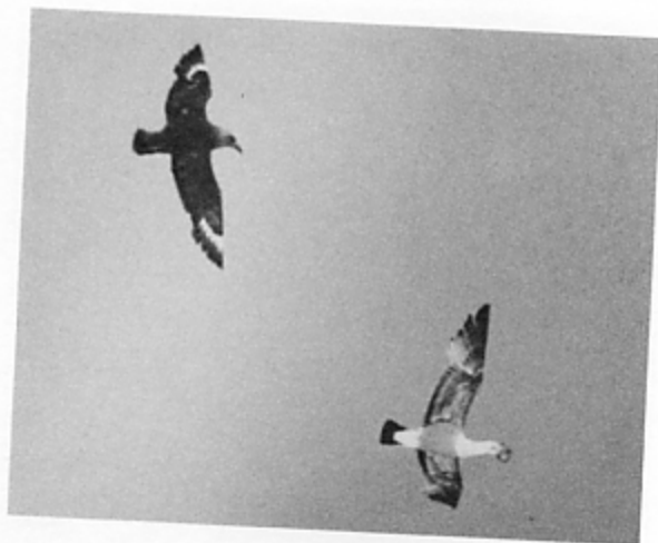
SOUTH POLAR SKUA ( Catharacta maccormicki ) parasitizing GREAT BLACK-BACKED GULL ( Larus marinus )—70 miles east of New Jersey, May 29, 1987