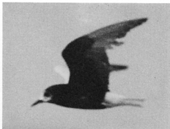
WHITE-WINGED TERN ( Chlidonias leucopterus )—Port Mahon, DE, July 13, 1987