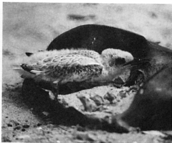
LEAST TERN ( Sterna antillarum )— Cape May, NJ, August 8, 1987