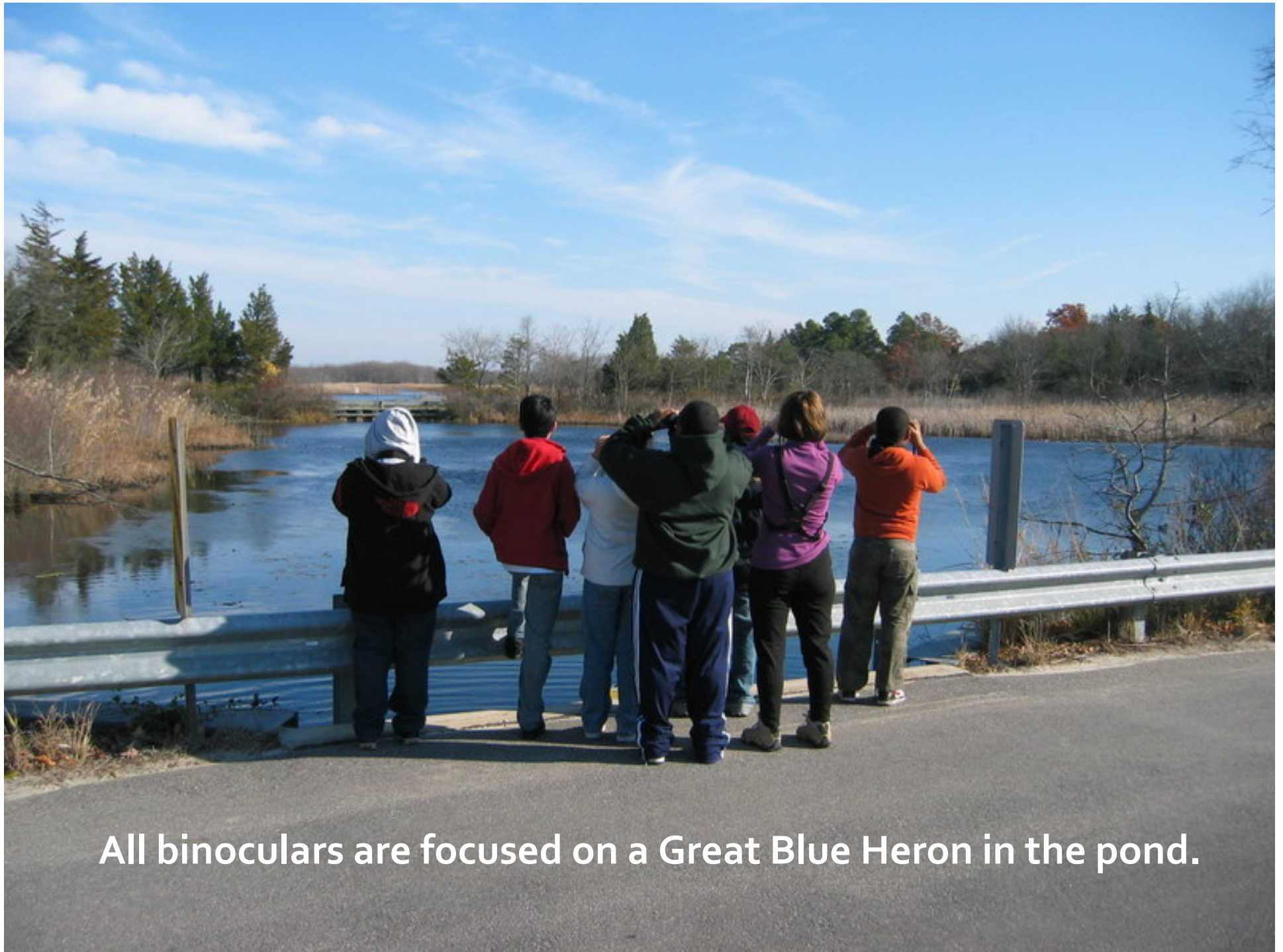
All binoculars are focused on a Great Blue Heron in the pond.