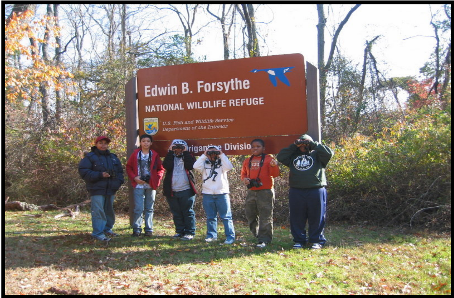
Troop 109 Boy Scouts of America Bird Study Merit Badge November 2010