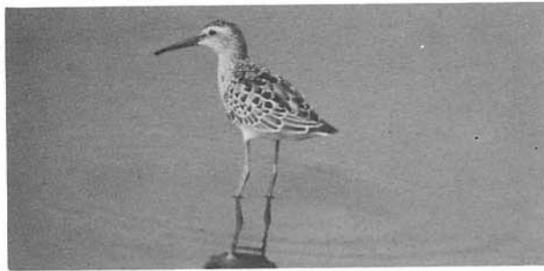
STILT SANDPIPER Cape May Point September, 1981 (Alan Brady)