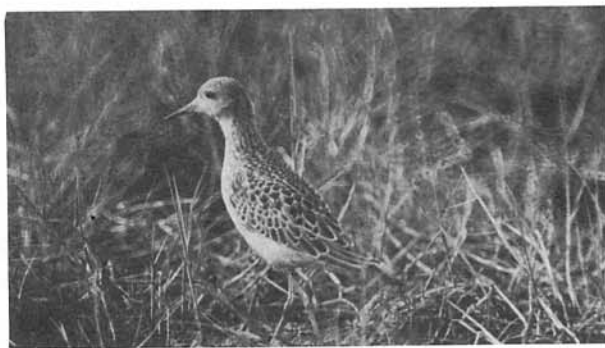
BUFF-BREASTED SANDPIPER Cape May Point August 30, 1981 (Alan Brady)