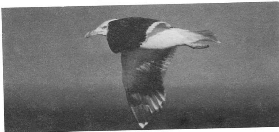
LESSER BLACK-BACKED GULL 40 miles east of Cape May, NJ October, 1981 (Alan Brady)