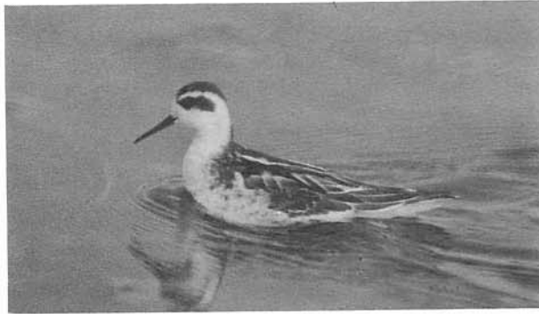
NORTHERN PHALAROPE Cape May Point September 6, 1981 (Alan Brady)