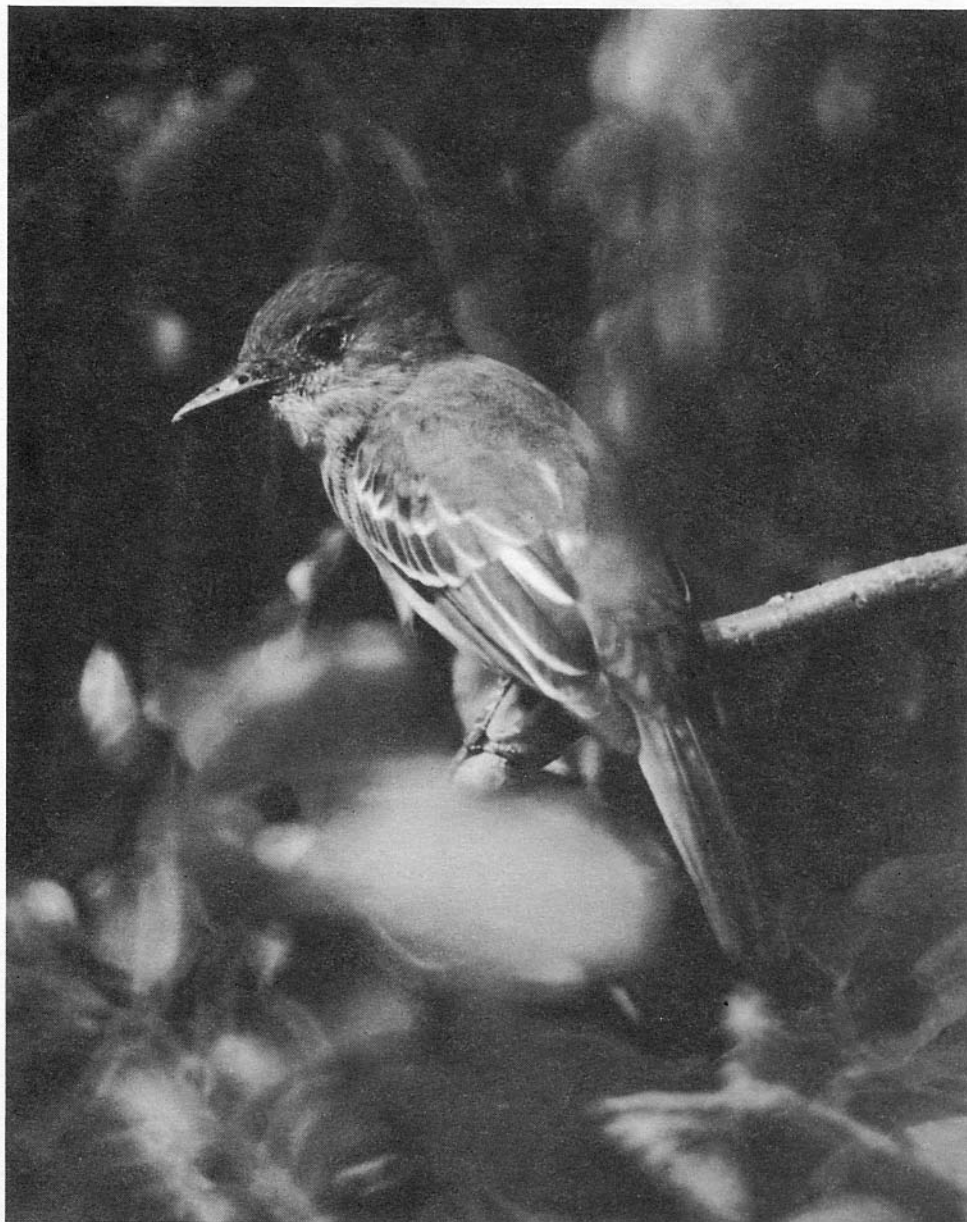
ASH-THROATED FLYCATCHER, HIGBEE'S BEACH, NJ